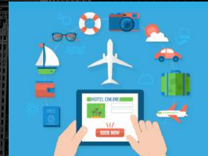
Partnership Email Campaign