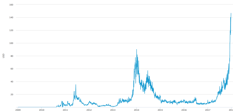
Figure 2: Cost per Bitcoin transaction, since 2009

In the Bitcoin network, users who send Bitcoin can increase the fees they spend to prioritize their transaction. In periods of high network congestion, users have been known to spend significant amounts of money to get their transactions processed. Figure 2 shows how the average US dollar cost of transaction fees and block rewards paid to miners has been increasing since Bitcoin's inception. 13