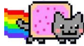
Sunerok Cryptography Developer