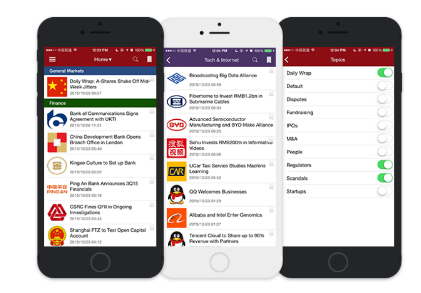
Figure 3: Red Pulse iOS app

activity is dominated by individual investors, representing an estimated 80% of all trading activity [12]. Although investors are very quickly becoming adept at developing their own investment strategies and views, most investors are newcomers to the market and have only a few years of experience, given how nascent [13] China's capital markets are, and the relative short period of time that individual investors have been given access.